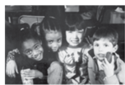
IMPROVING CHILDREN'S HEALTH Printed with permission of the Children's Defense Fund © 2006. All rights reserved.

Advancing the health of all children is the objective of Improving Children's Health: Understanding Children's Health Disparities and Promising Approaches to Address Them (2006).