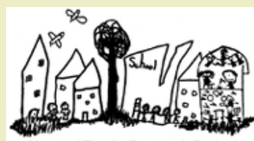
Harvard Family Research Project Harvard Graduate School of Education

Harvard Family Research Project Out-Of-School Time Evaluation Database and Bibliography