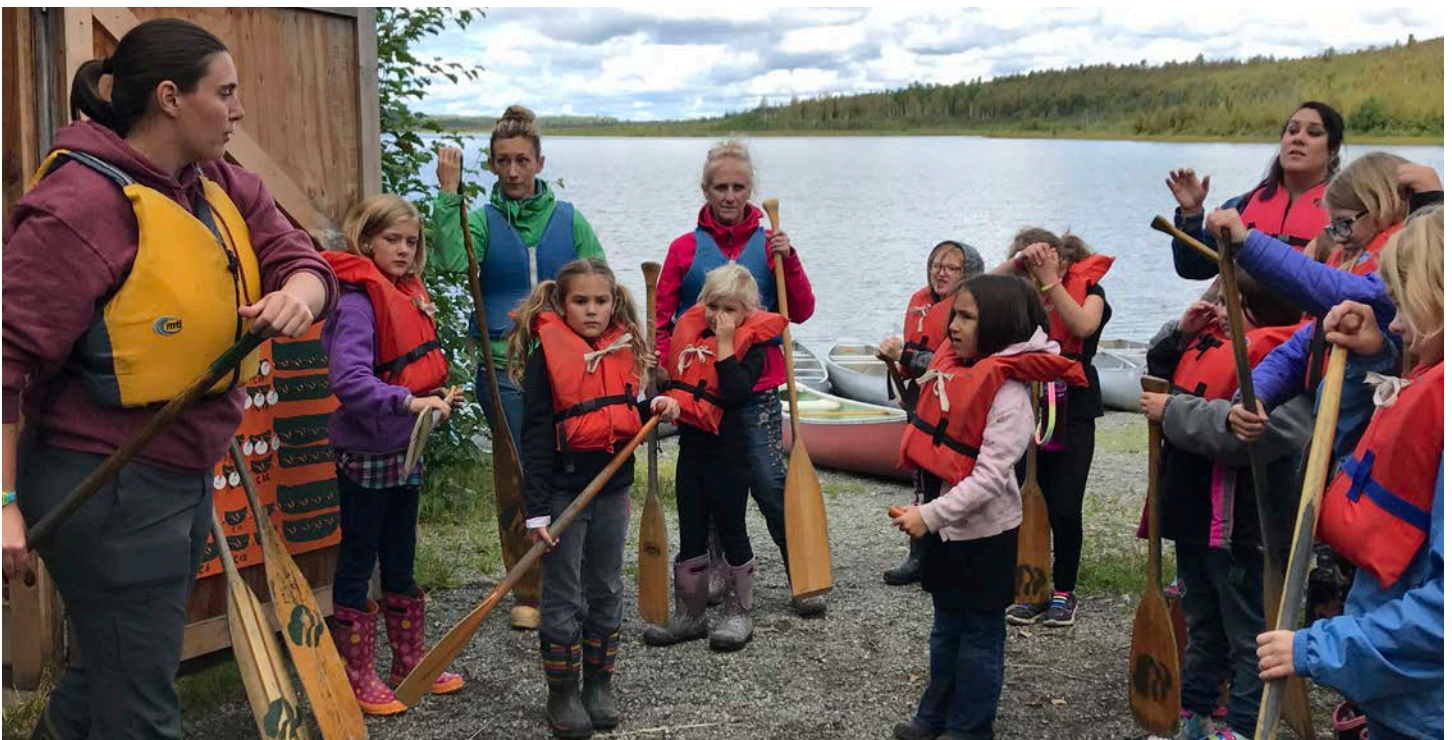
Girl Scouts of Alaska prepares girls and adults for canoeing.