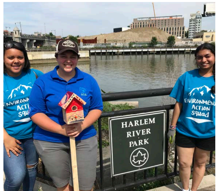
Left: Girl Scouts from the GSGNY Day Camp getting hands on experience building bird houses for a Take Action project.