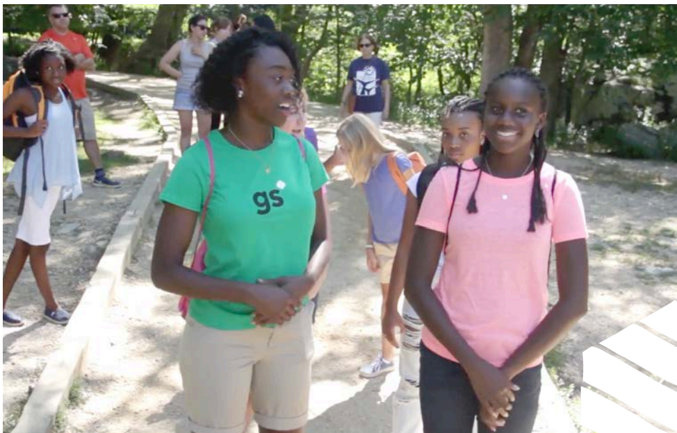
GSACP Girl Scouts and their families participating in Get Out Challenges.