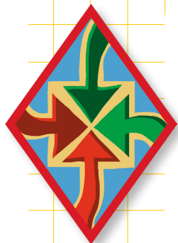
Finding Common Ground badge

As a Cadette , your daughter can earn the Finding Common Ground badge on her own or with her troop. In the process, she'll learn strategies that can help bring people with different beliefs together to make decisions about our world. But beyond that, she'll gain skills to help her solve conflicts in a respectful and peaceful manner.