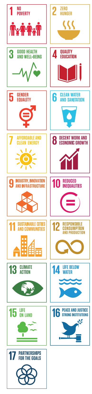
The 17 Sustainable Development Goals established by the United Nations in 2015

Important note: Links to third-party websites are provided for convenience only. Girl Scouts of the USA (GSUSA) does not endorse or support the content of third-party links and is not responsible for the content or accuracy, availability, or privacy/security practices of other websites, and/or services or goods that may be linked to or advertised on such third-party websites. By clicking on a third-party link, you will leave the current GSUSA site whereby policies of such third-party link may differ from those of GSUSA.