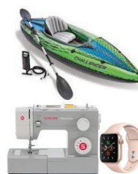
Sewing Machine OR Inflate Kayak OR Apple Watch 1700+ pkgs