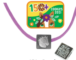
150+ Patch AND Necklace 150+ pkgs