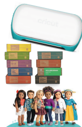
6 months KiwiCo OR American Girl Doll OR Circuit Joy Machine 1500+ pkgs