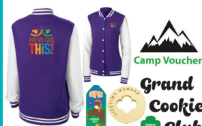
Super Patch and choice of: Jersey Jacket OR Camp Voucher OR Lifetime Membership for Graduating Seniors 1000+ pkgs

Backpack Purse Sell 200+ pkgs through Digital Cookie to earn.