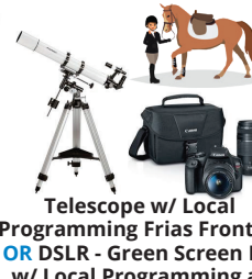
Telescope w/ Local Programming Frias Frontier OR DSLR - Green Screen Kit w/ Local Programming at Frias Frontier OR Horse Camp Sessions and Party 3000+ pkgs