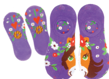
No-Show Horse Socks 75+ pkgs