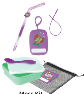
Mess Kit AND Straw w/ Pouch 425+ pkgs

Bandana is earned by girls with 350+ pkgs on Initial Order 1 per girl, 2 per troop