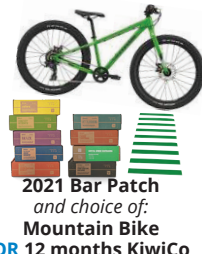
2021 Bar Patch and choice of: Mountain Bike OR 12 months KiwiCo OR Beach Towel & 4 Local Passes for Summer Fun 2021+ pkgs