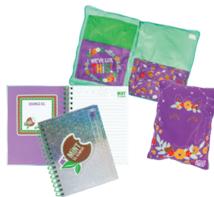
Journal w/ Pouch AND Pocket Pillow 550+ pkgs