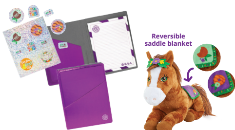
Padfolio AND Cookie Bling OR Plush Horse 300+ pkgs