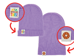
Beanie 200+ pkgs