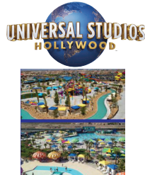
Universal Experience OR 2021 Water Park Season Pass 1200+ pkgs