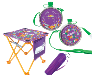
Camp Stool AND Glow-in-the-Dark Canteen 700+ pkgs