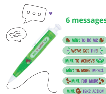
Message Pen 125+ pkgs